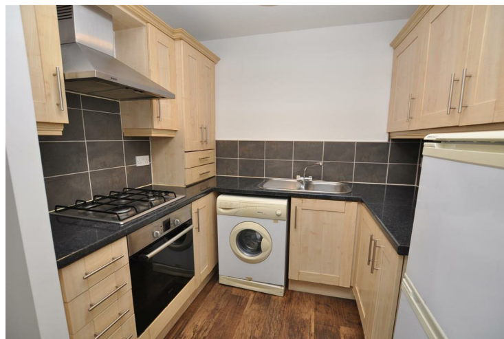
Council Tax Band: A

Draft details awaiting vendor approval and subject to change